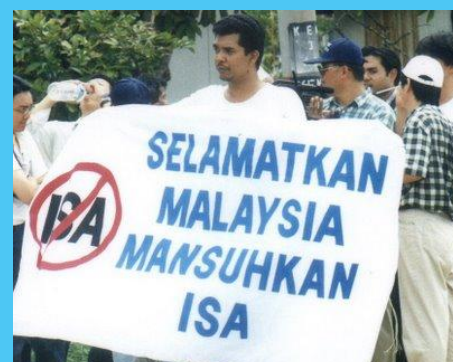
Protestor calling for abolishment of the ISA