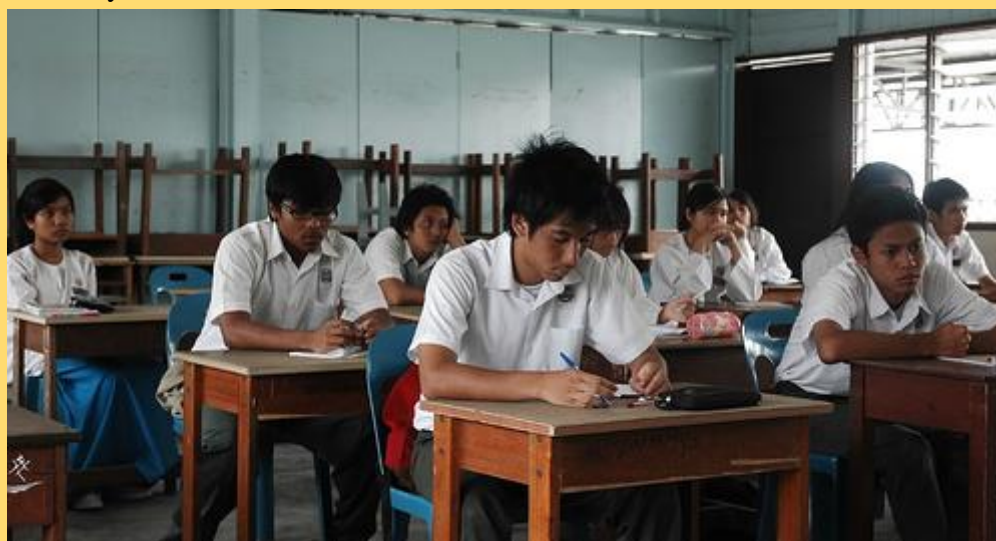
Primary and secondary school students will be studying science and mathematics in Bahasa Malaysia as well as in Tamil and Mandarin in the respective vernacular schools instead of English beginning in 2012