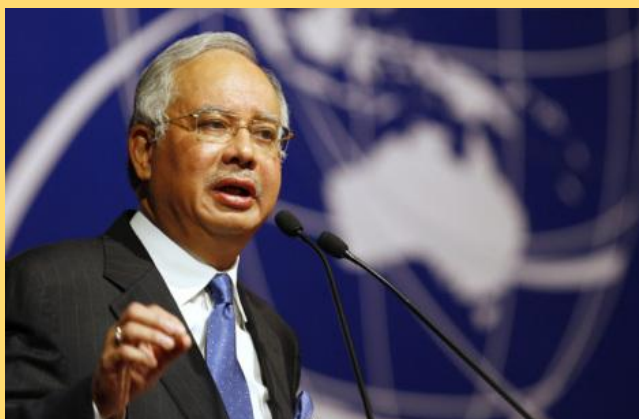
30 June 2009: PM Najib Razak announces a major liberalization of the Malaysian economy