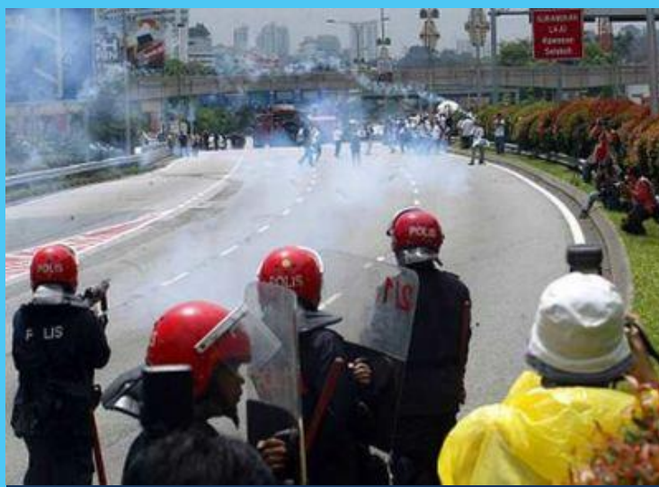
7 March 2009: Riot police firing teargas into several hundreds of people marching to Istana Negara to protest the use of English in the teaching of mathematics and science